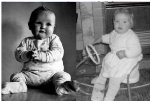
Guess who these two reprobates are?

We have now received a few photo books for the children and those that have them are enjoying sharing them with their friends and staff.