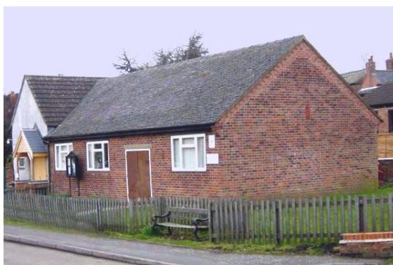
The village hall opposite the school