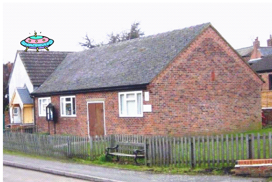
The village hall opposite the school